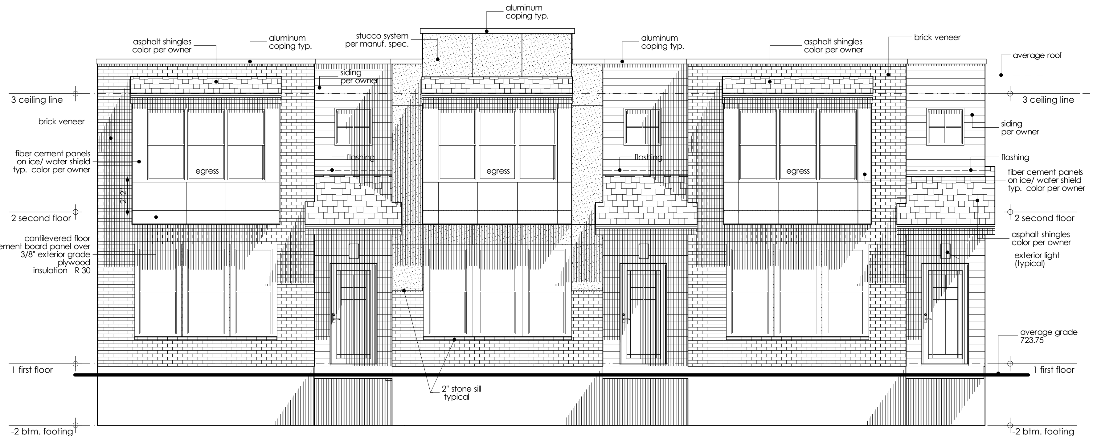
Left Elevation - 3 units